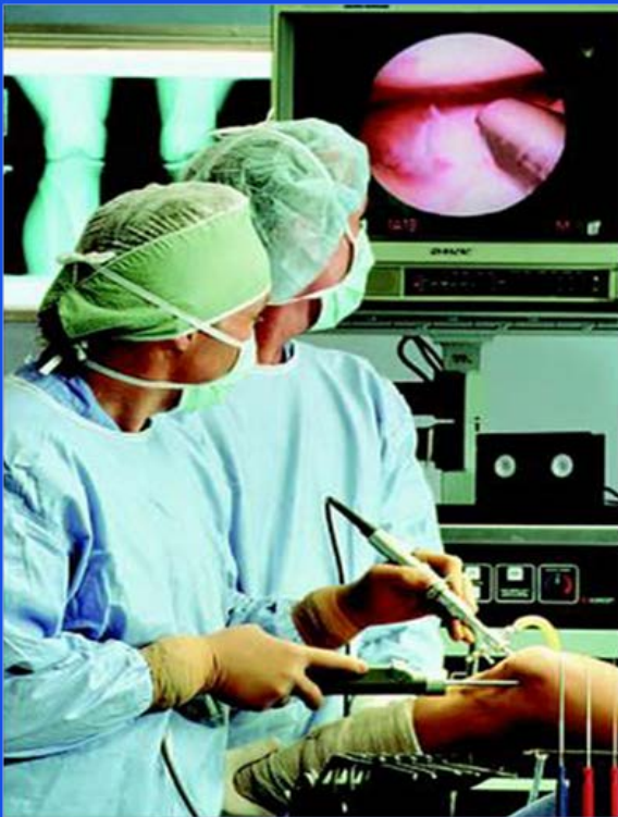
Minimally Invasive ARTHROSCOPIC KNEE Surgery